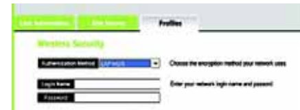
Figure 6-27: EAP-MD5 Authentication

Click Next to continue or Back to return to the previous screen.